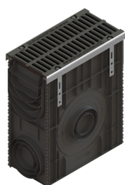
Camin + Gratar

BASE sealant, construction products, 310 ml tube (G12M29-C).