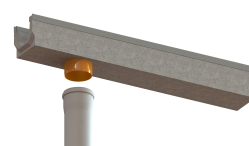
Disponibil si cu conexiune verticala