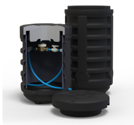
Disponibil si cu izolatie

BASE sealant, construction products, 310 ml tube (G12M29-C).