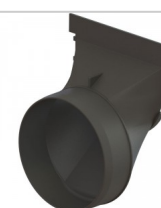
Placa capat PP EASY 3 pt rigola LN100 Hext.100 cu iesire orizontala D.110 (682909)