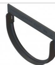
Piesa trecere PP EASY 3 de la rigola LN100 Hext.100 la camin PP EASY (6824)