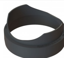
Conexiune verticala PP EASY 3 pt rigola LN100 Hext.100 (6827)