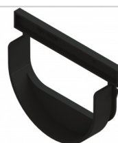
Piesa trecere PP EASY 2 de la rigola LN100 Hext.70 la camin PP EASY (6828)