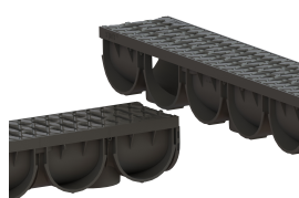
Conexiune 90 grade