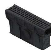
Kit Camin PP EASY 2/3 Inspectie cu gratar PP A15 509x133x250(0888081)