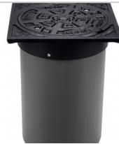
Capac FONTA PIPE BASE cu tub telescop pt tub gofrat D315. H.0,5 m B125 (TT666400)