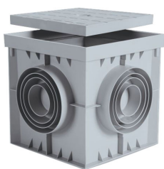
Camin + Capac

BASE sealing paste (sealant) PP-FB-PB gutters, tube, 310 ml (G12M29-C)