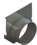
Placa capat OZ PRO cu stut DN110 pt rigola FB LN100 Hext.190-230 (61013409-1)