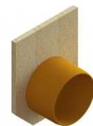
Placa capat PB PRO cu stut pt rigola FB LN100 Hext.210 (6701-09BD/210)